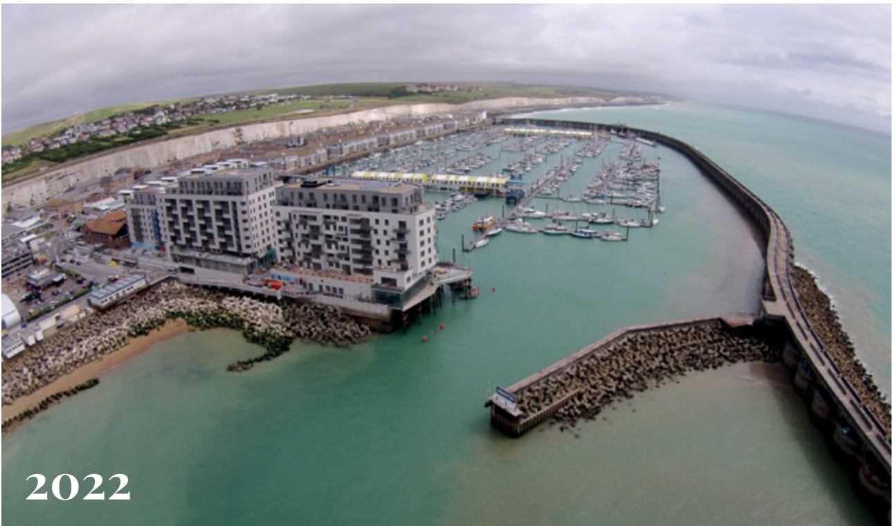
25 years of development progress at Brighton Marina