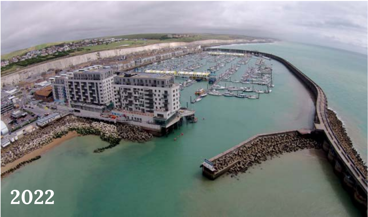
25 years of development progress at Brighton Marina